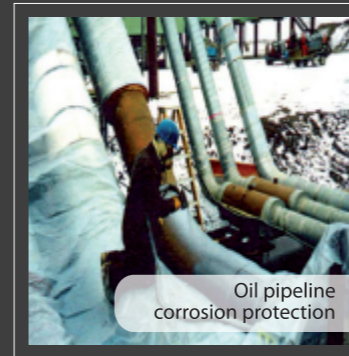
Oil pipeline corrosion protection

Polyshield HT-SL™ is a fast-set, high-performance, spray-applied, plural-component, pure polyurea elastomer. This system is based on amine-terminated polyether resins, amine chain extenders, and prepolymers. It provides a cost-effective, flexible, tough, resilient monolithic membrane with water and chemical resistance.