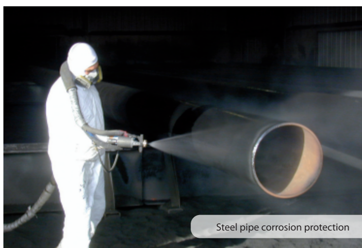
Steel pipe corrosion protection