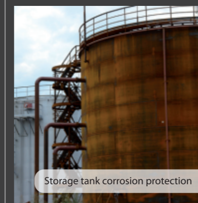
Storage tank corrosion protection