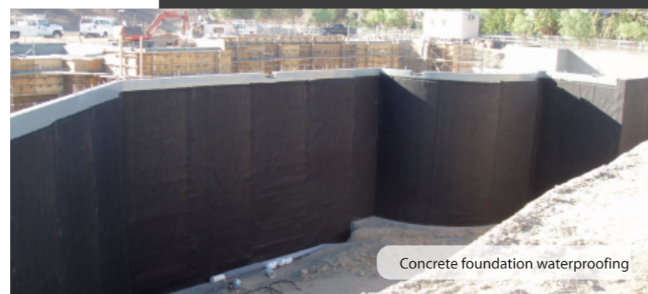
Concrete foundation waterproofing