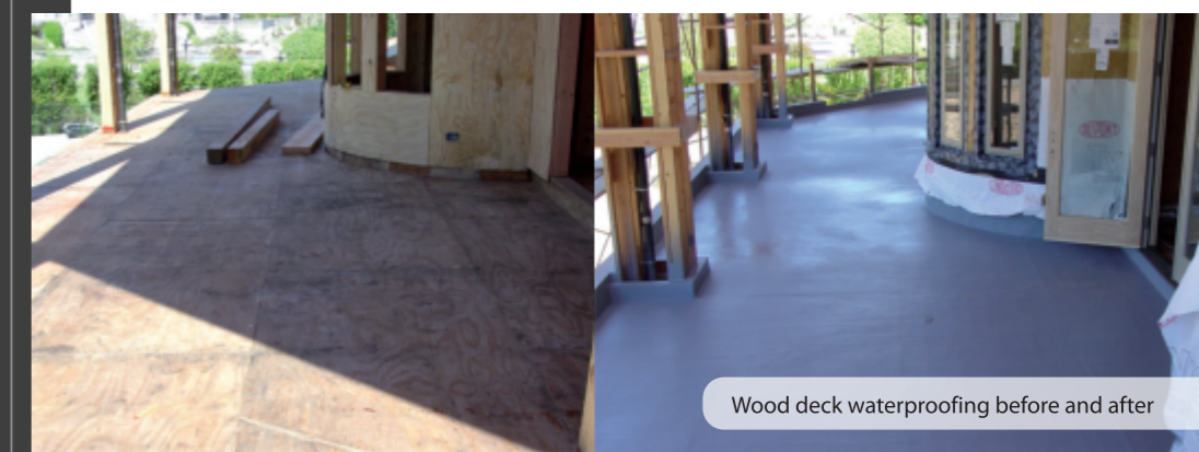
Wood deck waterproofing before and after